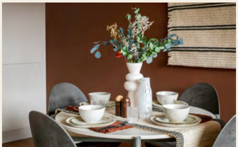
Table and chairs