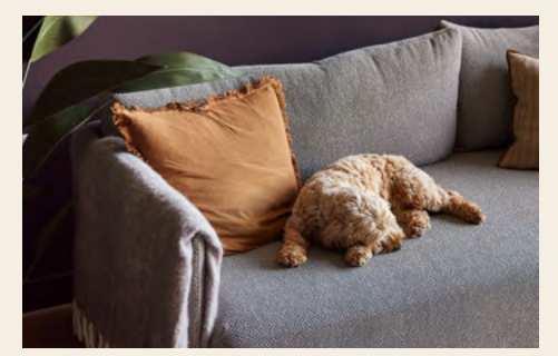
2 person sofa

BEDROOM King-size ottoman based bed with bespoke bedside tables and built-in wardrobes with floor-to-ceiling mirrors on the doors.