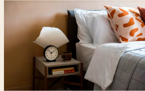
King-sized bed & bedside cabinets

All homes at The Goodsyard come with these amenities and perks for free.